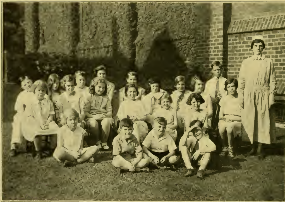
A Daily Vacation Bible School